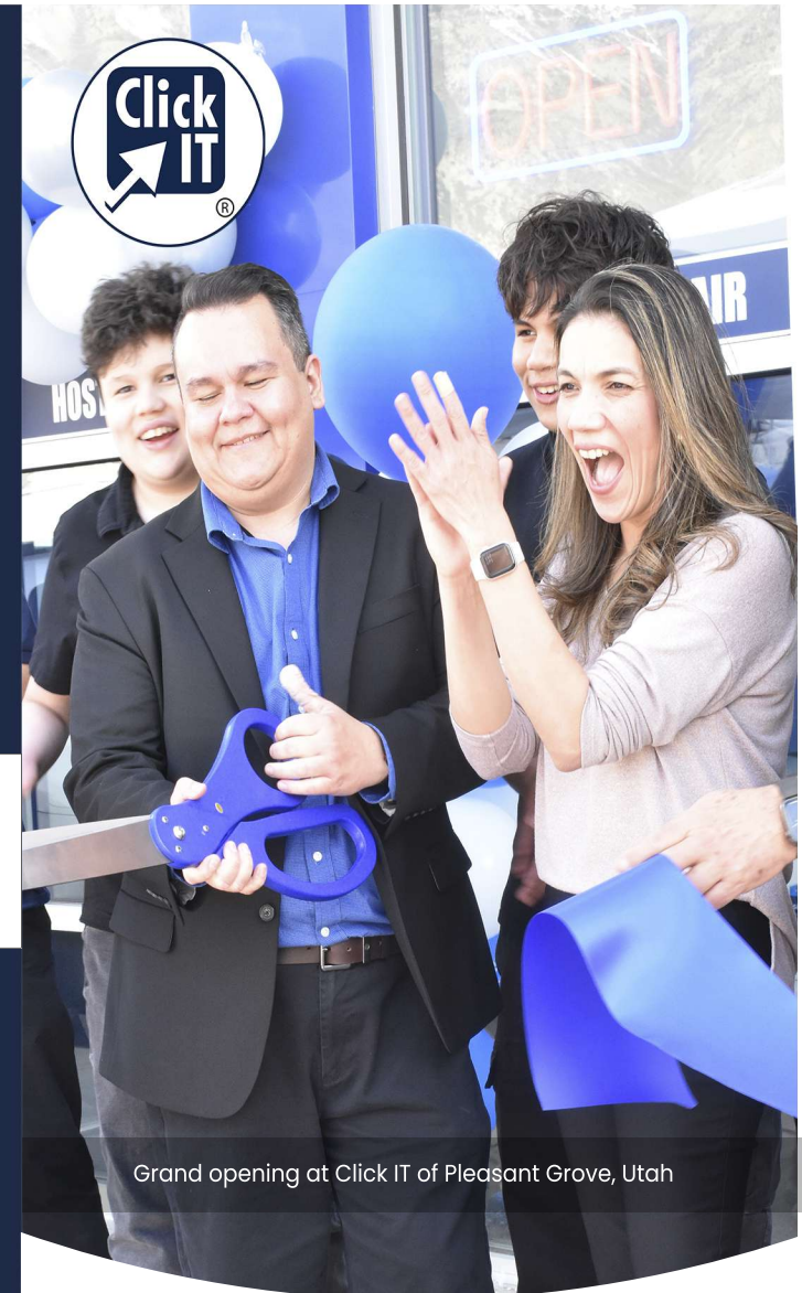
Grand opening at Click IT of Pleasant Grove, Utah

© 2025 Click IT® by Motherboard, Inc. "Your Local IT Department"™